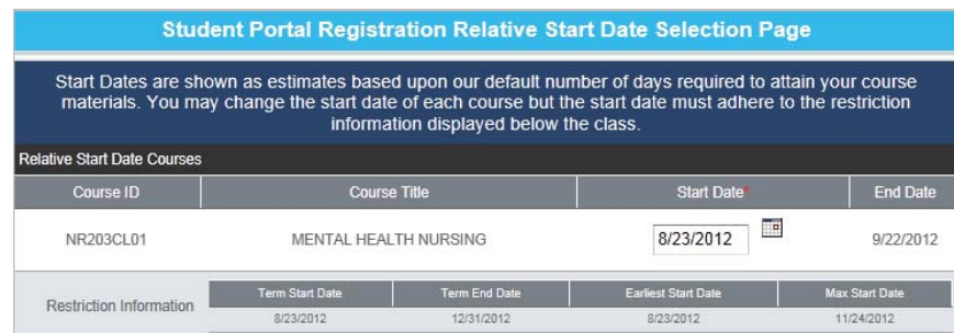
Figure 36: Relative Start Date Selection page

When registering courses that utilize relative start dates, such as a 30 day course within a 4 month term, clicking Process Registration will present students with an additional screen where they may choose the Start Date for these courses. The End Date will calculate automatically according to the length of the course. You must adhere to the Restriction Information displayed for each course when choosing the Start Date. No registration changes are saved at this point. All registration changes will save upon clicking Save Registration on this screen or you may click Cancel Registration to cancel all changes made in this session.