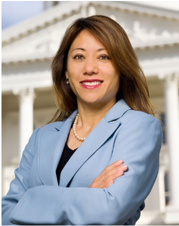
Fiona Ma, CPA California State Treasurer

Fiona Ma is California's 34th State Treasurer. She was elected on November 6, 2018, with more votes (7,825,587) than any other candidate for treasurer in the state's history. She is the first woman of color and the first female Certified Public Accountant (CPA) elected to the position. The State Treasurer's Office was created in the California Constitution in 1849. It provides financing for schools, roads, housing, recycling and waste management, hospitals, public facilities, and other crucial infrastructure projects that better the lives of residents. California is the world's fifth-largest economy and Treasurer Ma is the state's primary banker. Her office processes more than $2 trillion in transactions, within a typical year. She provides transparency and oversight for the government's investment portfolio and accounts, as well as for the state's surplus funds. Treasurer Ma oversees an investment portfolio that has averaged well over $100 billion during her administration—a significant portion of which are beneficially owned by more than 2,200 local governments in California. She serves as agent of sale for all State bonds and is trustee of billions of dollars of state indebtedness.